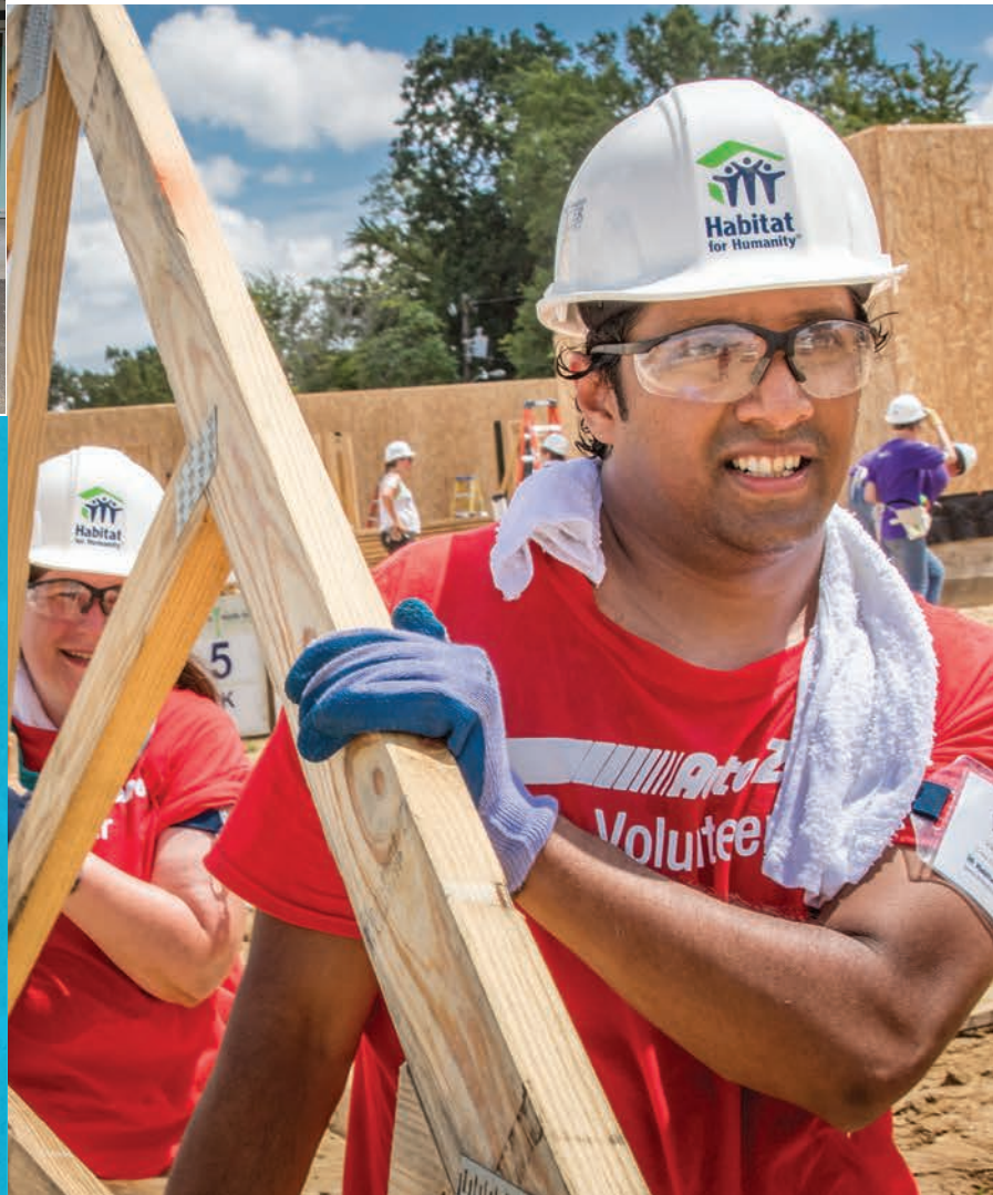
Team Urban Systems- Okanagan 2022