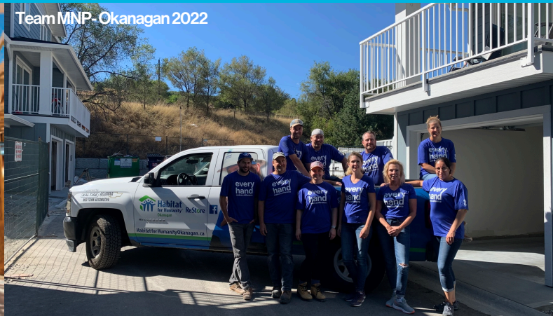
Team MNP, Okanagan 2022