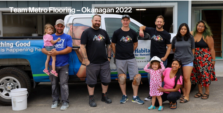
Team Metro Flooring – Okanagan 2022