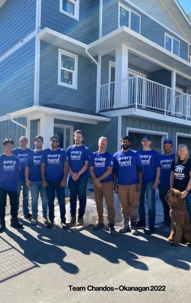
Team Chandos—Okanagan 2022

“Through Habitat Build Days Traine Construction employees are given the opportunity to help their community prosper by pitching in and making homeownership, and a brighter future possible for families in need of decent, affordable housing. The build days we are a part of are very enriching and rewarding in so many ways and an honour to be part of this experience.”