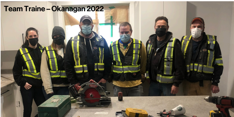
Team Traine – Okanagan 2022