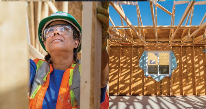
Team Flex Realty - Okanagan 2021

- Traine Construction & Development Build Day Participant