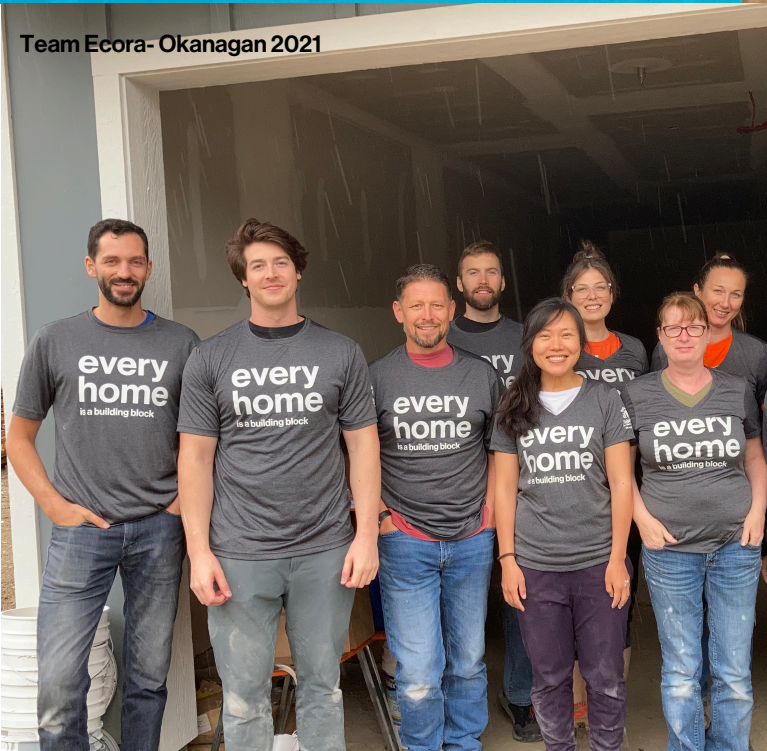
Team Ecora – Okanagan 2021