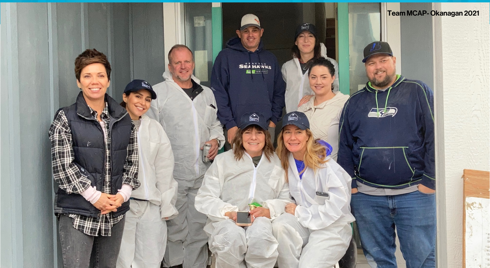
Team MCAP - Okanagan 2021

For more information please visit us at hfhokanagan.ca or email comms@hfhokanagan.ca