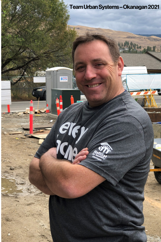
Team Urban Systems – Okanagan 2021

“Through Habitat Build Days Traine Construction employees are given the opportunity to help their community prosper by pitching in and making homeownership, and a brighter future possible for families in need of decent, affordable housing. The build days we are a part of are very enriching and rewarding in so many ways and an honour to be part of this experience.”